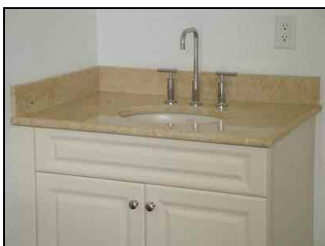
Villas of Positano in Hollywood Beach 001