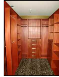
Villas of Positano in Hollywood Beach 027