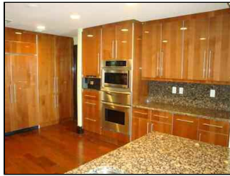
Villas of Positano in Hollywood Beach 058