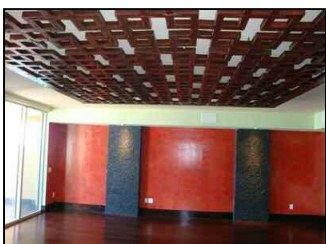
Villas of Positano in Hollywood Beach 077