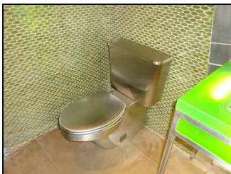
Villas of Positano in Hollywood Beach 069