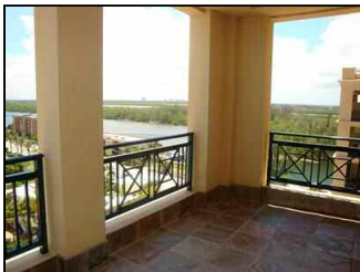
Villas of Positano in Hollywood Beach 033