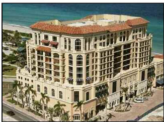
Villas of Positano in Hollywood Beach