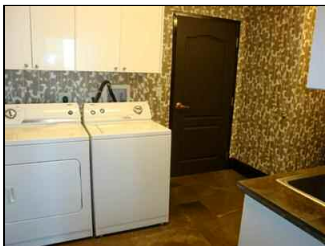
Villas of Positano in Hollywood Beach 072