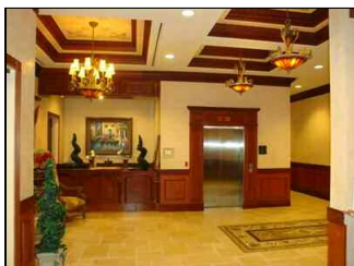
Villas of Positano in Hollywood Beach 081