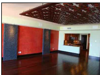
Villas of Positano in Hollywood Beach 067