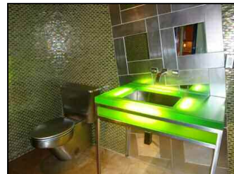
Villas of Positano in Hollywood Beach 053