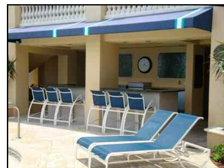
Villas of Positano in Hollywood Beach 013