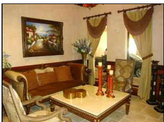
Villas of Positano in Hollywood Beach 080