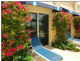
Villas of Positano in Hollywood Beach 011