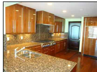
Villas of Positano in Hollywood Beach 057