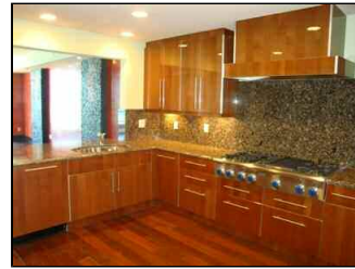
Villas of Positano in Hollywood Beach 071