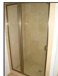
Villas of Positano in Hollywood Beach 004