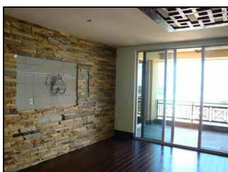
Villas of Positano in Hollywood Beach 060