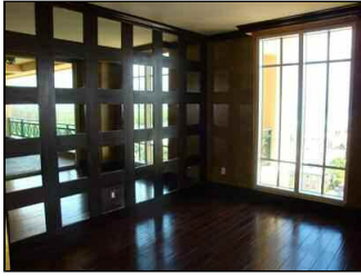
Villas of Positano in Hollywood Beach 017

Phone: (786) 406-1757 Cell: (305) 788-9393 Fax: (786) 363-8552 Email: SunnyIslesBroker@gmail.com Website: www.sunnyislesbeachbroker.com