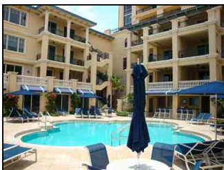
Villas of Positano in Hollywood Beach 009