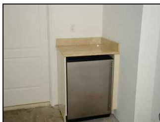
Villas of Positano in Hollywood Beach 002