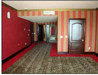
Villas of Positano in Hollywood Beach 035