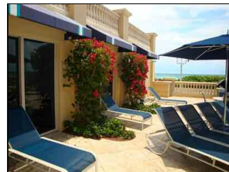
Villas of Positano in Hollywood Beach 012