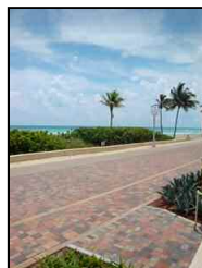
Villas of Positano in Hollywood Beach 008