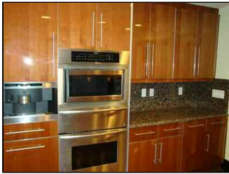
Villas of Positano in Hollywood Beach 076