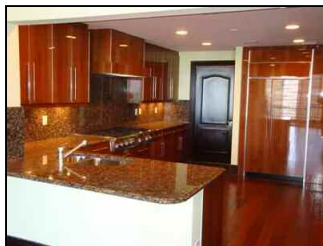
Villas of Positano in Hollywood Beach 056