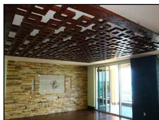
Villas of Positano in Hollywood Beach 055