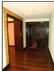
Villas of Positano in Hollywood Beach 047