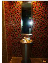
Villas of Positano in Hollywood Beach 037