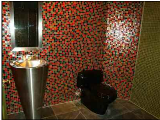
Villas of Positano in Hollywood Beach 042