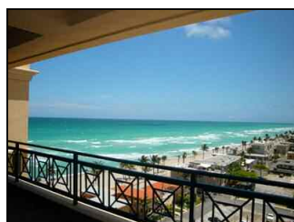
Villas of Positano in Hollywood Beach 068