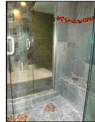
Villas of Positano in Hollywood Beach 039