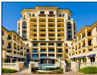
Villas of Positano in Hollywood Beach