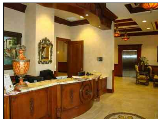
Villas of Positano in Hollywood Beach 087