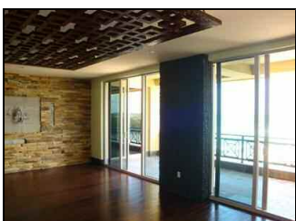
Villas of Positano in Hollywood Beach 066